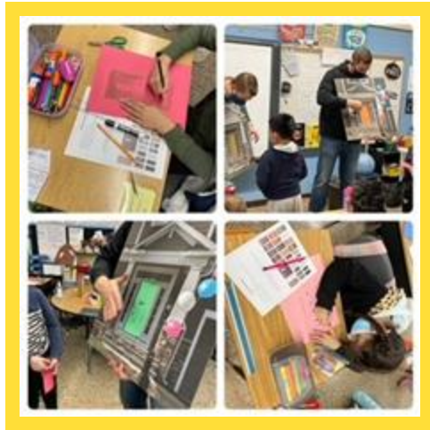
Career Cluster: Architecture and Construction