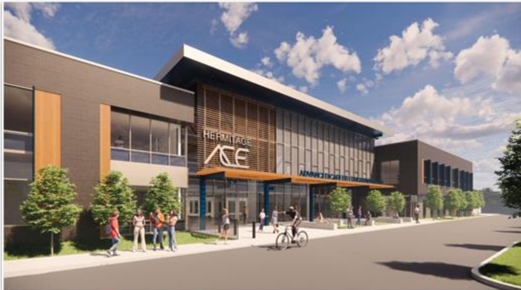
QUINN EVANS ACE CENTER AT HERMITAGE Henrico County Public Schools Advanced Career Education