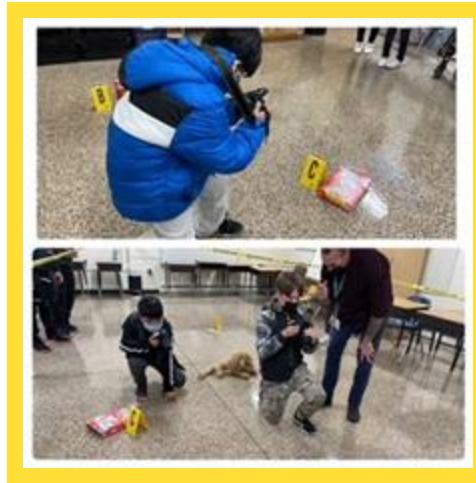
Career Cluster: Law, Public Safety, Corrections, & Security