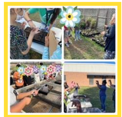
Career Cluster: Agriculture, Food and Natural Resources